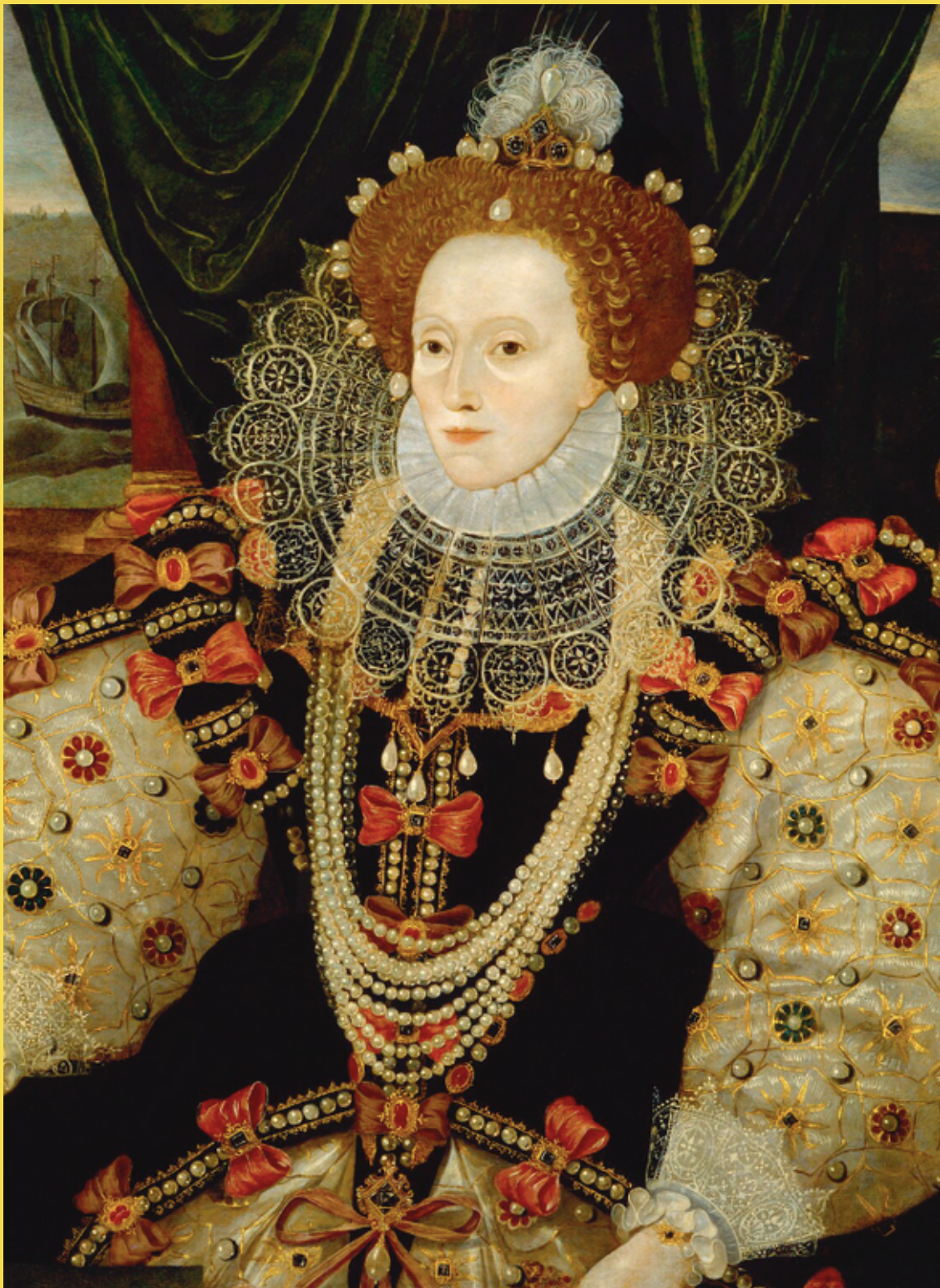
Queen Elizabeth I by Unknown English artist oil on panel, circa 1588

This portrait was painted to commemorate the most famous conflict of Elizabeth's reign, the defeat of the Spanish Armada in 1588.